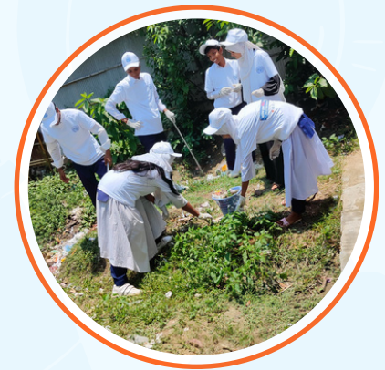
Youth-Led Community Action Campaign