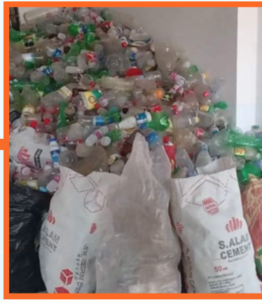
Plastic waste and marine litter reduced through a legacy waste collection model