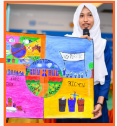
Enhanced Gender Inclusivity and Empowerment of Women in Environmental Advocacy