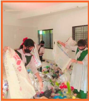
Increased Community Engagement and Participation