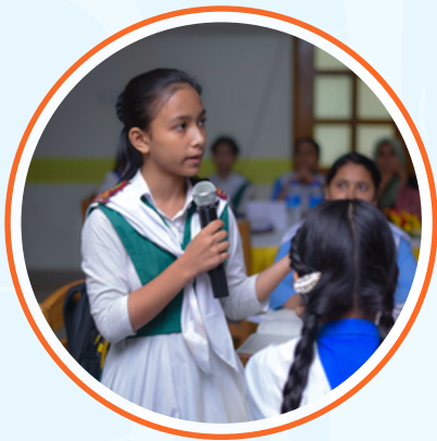
Youth Leadership Development